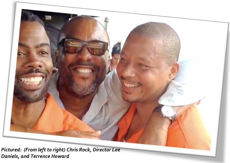
Pictured: (From left to right) Chris Rock, Director Lee Daniels, and Terrence Howard

Residents were excited to have Hollywood stars in the building. Likewise, cast members of Empire were excited to hear about the great things happening at the JTDC, such as